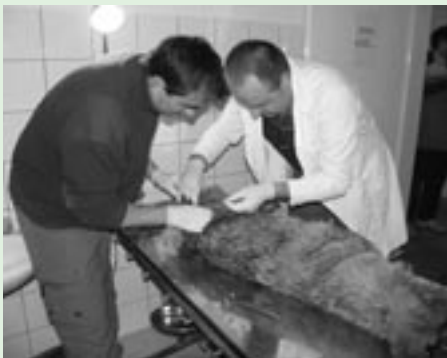
Female wolf Eva under surgical treatment in the veterinary ambulance in Imotski on 26 February 2005.

One of the regular 'Large Carnivores' committee meetings was taking place last February, when my mobile started to vibrate. An unknown voice told me that a wolf had been captured alive and was being