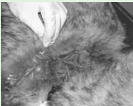
FWound on female wolf Eva under surgical treatment in the veterinary ambulance in Imotski on 26 February 2005.