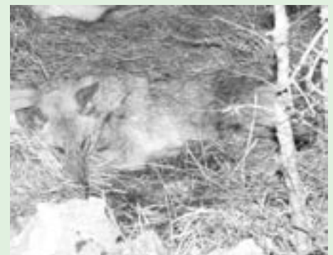
Female wolf Eva at the release site on 26 February 2005.

Eva and her pack crossed this border many times, staying in both countries (47.1% in Croatia and 52.9% in Bosnia and Herzegovina). They were visiting the slaughter dump and also the only herd of goats in a village. Damir Bosiljevac knew the