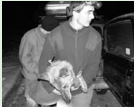
Releasing the wolf Eva after surgical treatment and marking with GPS-VHF collar.