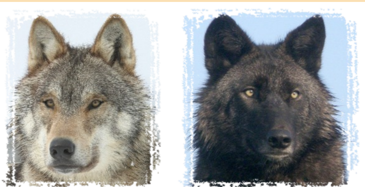
Torak (left) and Mosi (right), friends since infancy and now mates