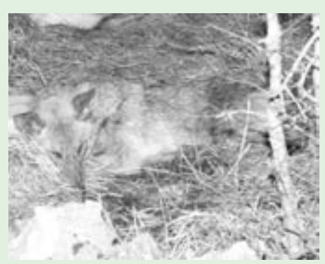
Female wolf Eva at the release site on 26 February 2005.

Eva and her pack crossed this border many times, staying in both countries (47.1% in Croatia and 52.9% in Bosnia and Herzegovina). They were visiting the slaughter dump and also the only herd of goats in a village. Damir Bosiljevac knew the