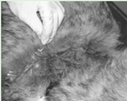
FWound on female wolf Eva under surgical treatment in the veterinary ambulance in Imotski on 26 February 2005.