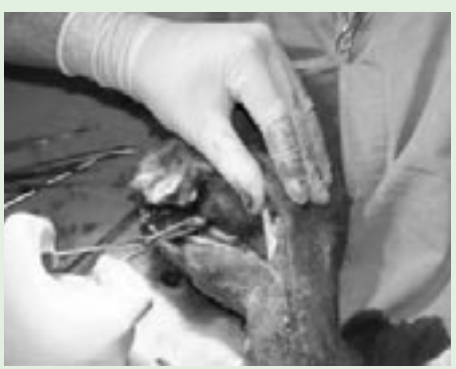
The X-ray taken showed the bone fracture in the right back leg caused by a shot and it was decided to perform a surgery. Unfortunately, during the treatment the wounds were found to be too serious to cure, deeply infected and invaded by maggots.