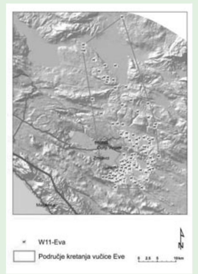
Locations (541) and range (640 km2) in Croatia and B&H of female wolf EVA during 157 days of tracking in 2005.

owner well as he was often called on to examine cases of wolf attacks on that herd.