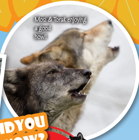
Mosi & Torak enjoying a good howl!