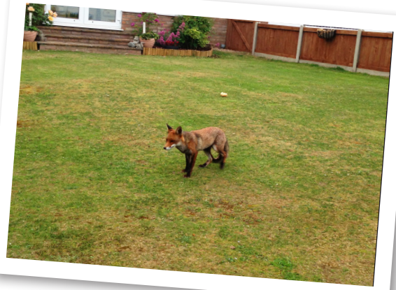
The Brave Fox