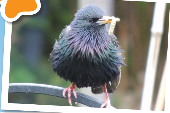
Starling and Caterpillar